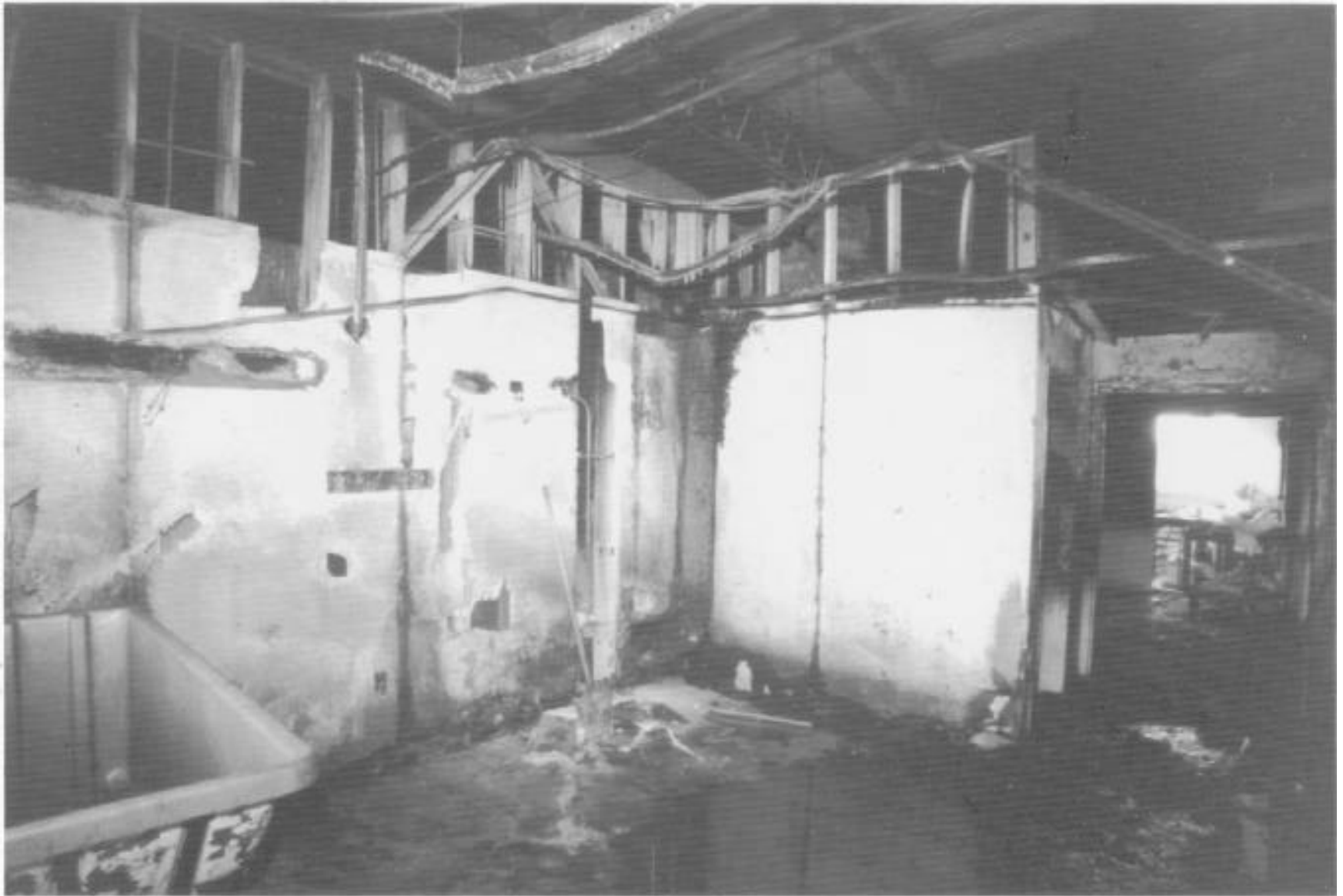
There was very heavy damage to the room of origin. Some structural members were warped by heat after the suspended ceiling collapsed.