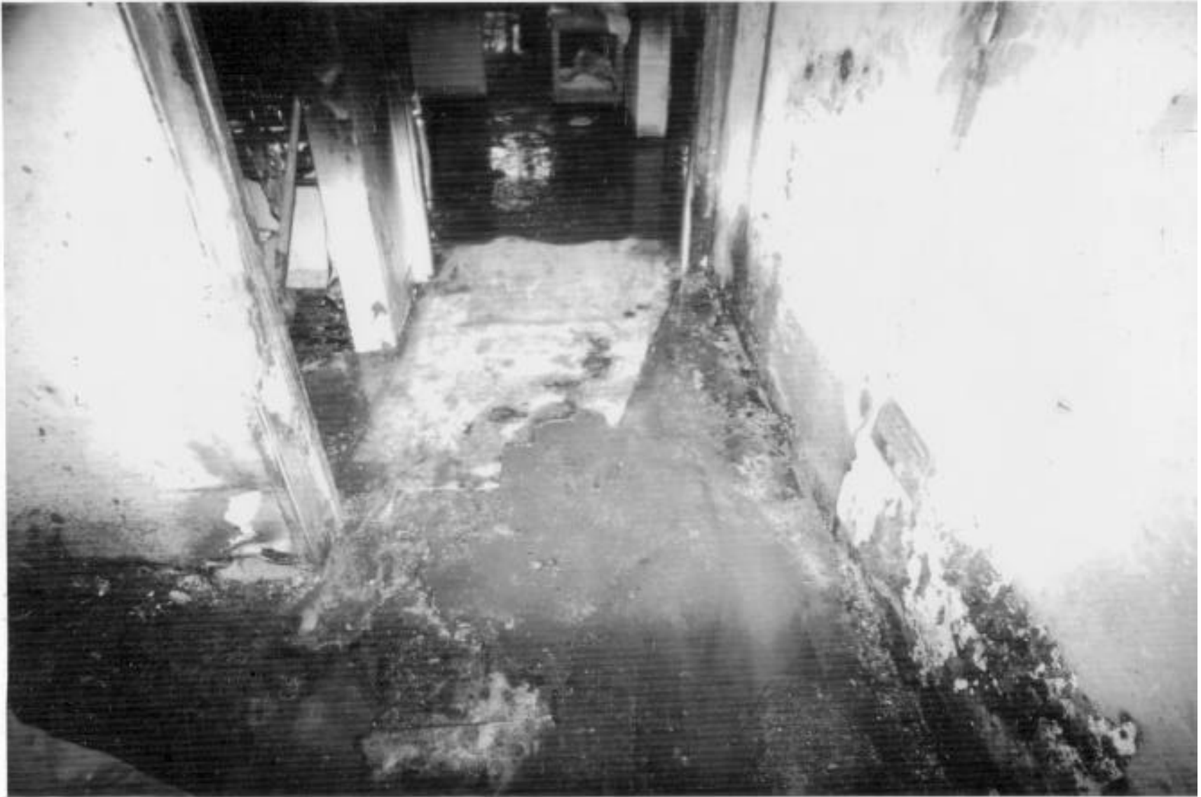
All but a small portion of the floor tile in the room of origin was consumed by the fire. This portion was partially shielded by the door to the room, which was open during the fire. The straight line pattern of burned away tile next to the right side of the doorway indicates the position of the door during the fire.