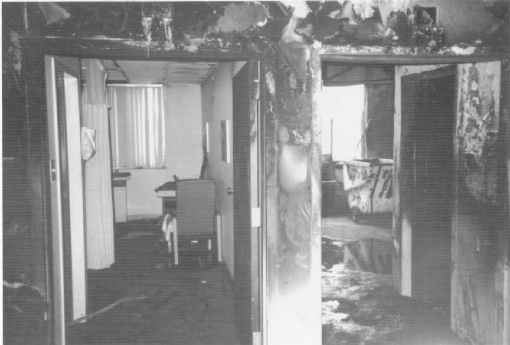
This photo shows the heavy damage to the fire room, Room 418 (on the right), and the adjacent room, Room 419 (on the left). Nurses closed the door to Room 419, but heavy smoke infiltrated the room through the suspended ceiling and cracks around the edges of the door. The patients in both of these rooms died.