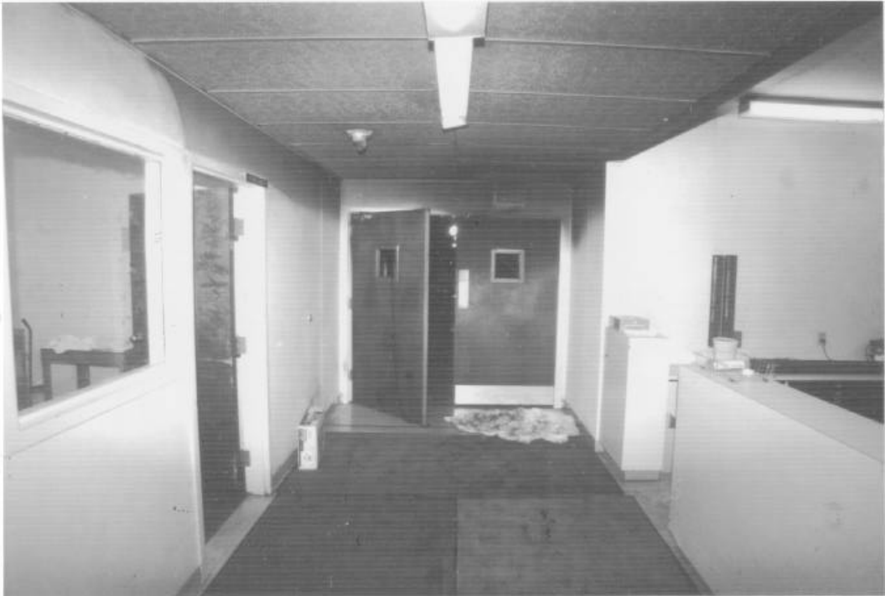
This photo looks down toward the south corridor with the nurses station on the right. The self-closing smoke control doors contained the bulk of the smoke and heat conditions to the corridor of origin, but some smoke escaped into the nurses station area as victims were evacuated through the doors.