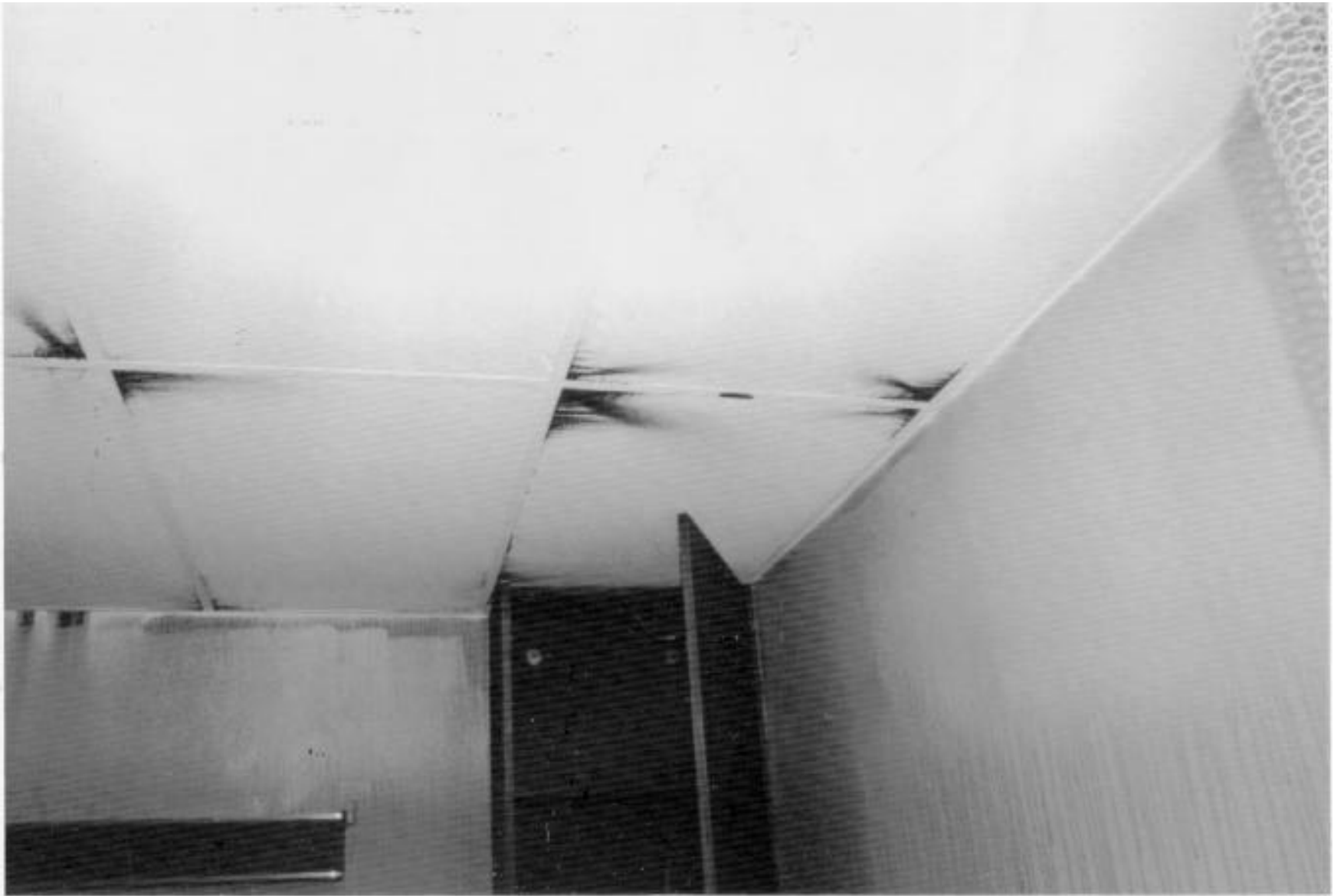
Smoke streaks on the ceiling indicate that smoke was entering the rooms adjacent to the fire room through the ceiling suspension system.