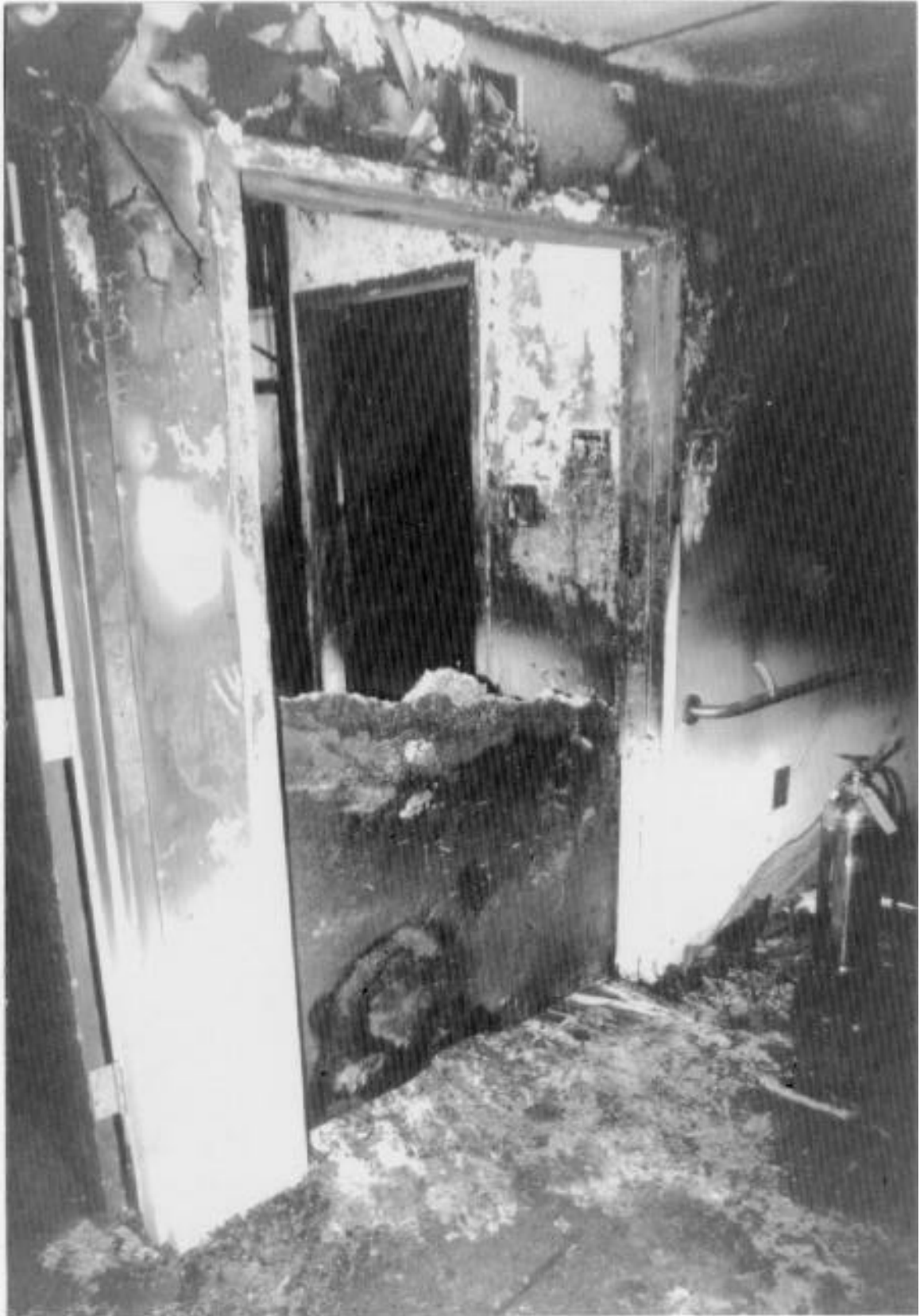
There was heavy smoke and heat damage around the door to the room of origin. The top portion of the door burned away in the fire.