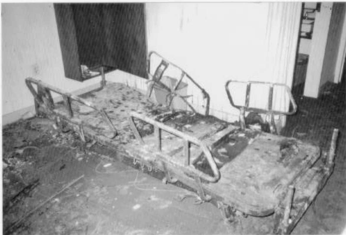
The beds in the hospital contained heavy amounts of plastic and foam parts. Only the metal frame of the patient's bed was recognizable in the room of origin.