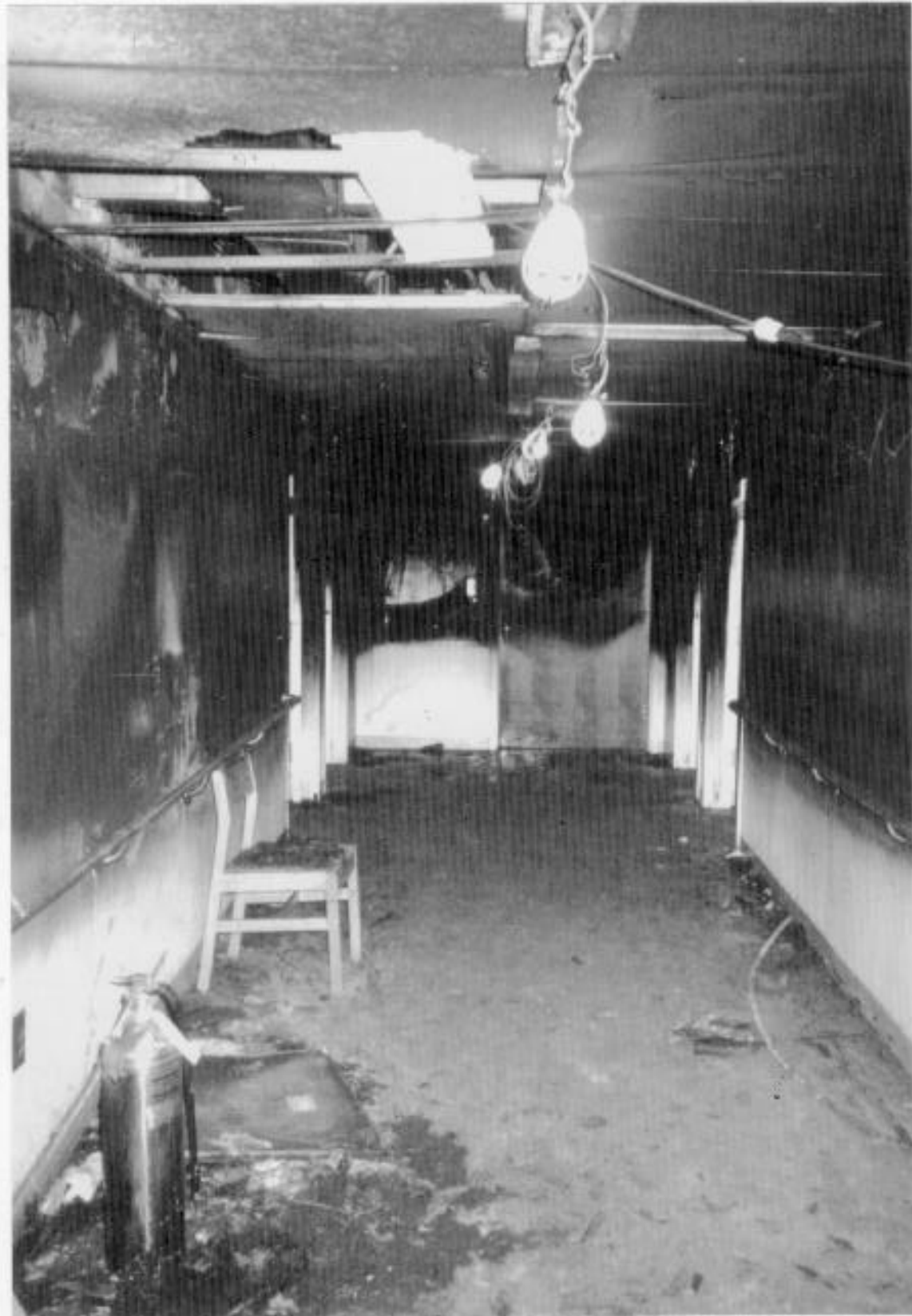
This photo shows the extent of smoke spread in the south corridor, looking down from the room of origin. At the end of the corridor is an exit, a hose cabinet containing a Class 3 standpipe connection and occupant use-hose, and a fire extinguisher, as well as the manual pull station that was activated by a nurse.