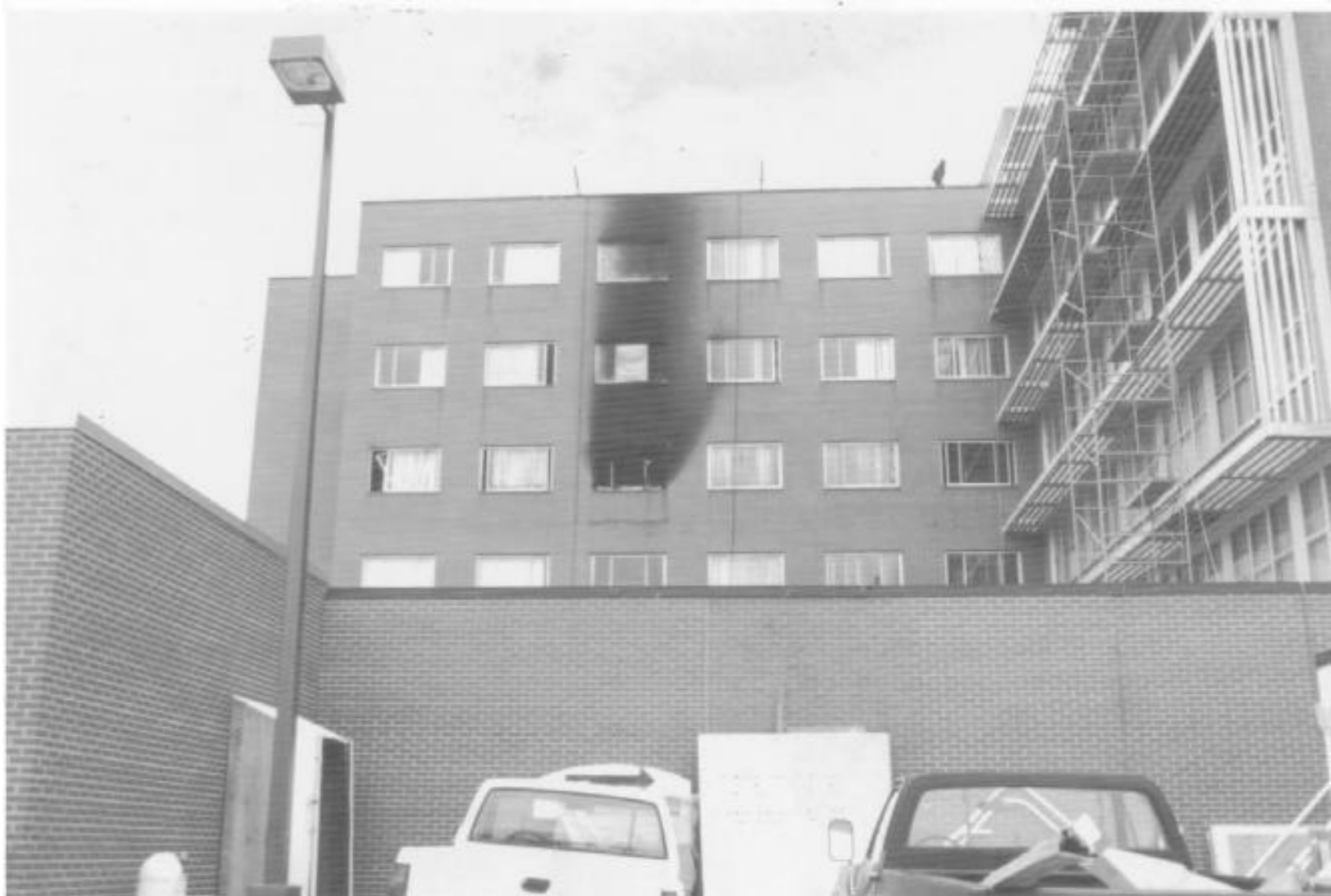
The first floor of the hospital extended out from the upper floors of the building, which blocked access to the fourth floor windows by an aerial ladder. Firefighters used a ground ladder from the roof of the single story wing to rescue a patient from a window located two rooms to the left of the room of origin.