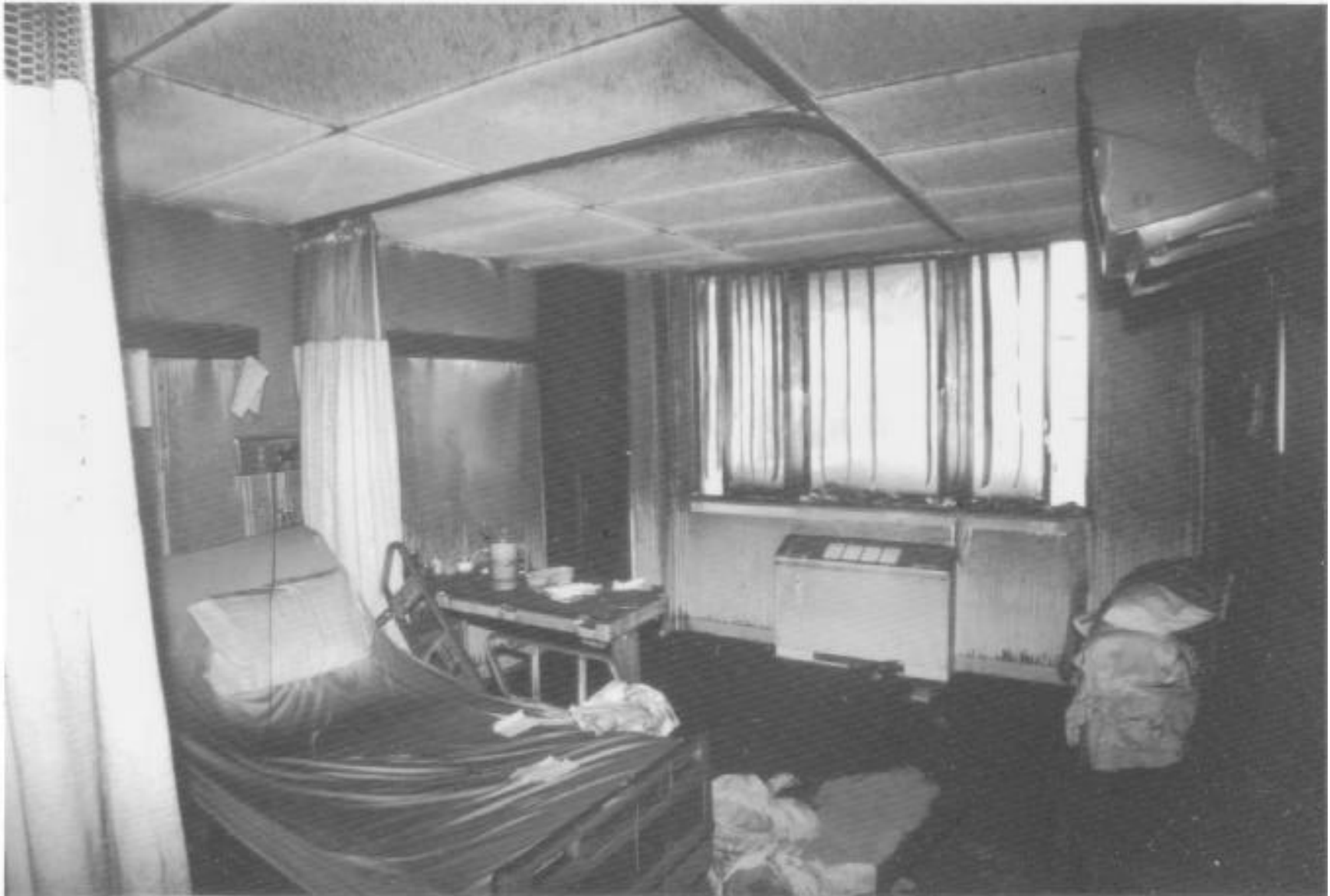
Room 421 which was located on the south corridor suffered heavy smoke damage. Nurses closed the door to this room, however, investigators believe the patient opened the door while attempting to escape. The patient was found lying in the doorway by firefighters.